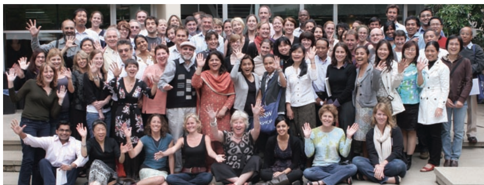
Second Intensive Course on Health, Development and Human Rights held at UNSW 8 - 12 December, 2008

The course was attended by 74 participants comprising UNSW postgraduate students, PhD candidates, and national and international professionals. Pivotal to the design of the course was the mix of participants with experience and expertise from diverse backgrounds including law, public health, community and international development, social work and related research. The course also benefited from a rich cultural diversity as participants and lecturers came from various geographical regions and countries including Australia, Brazil, Cambodia, Indonesia, Japan, Laos, New Caledonia, New Zealand, Philippines, Sri Lanka, Sweden, Timor Leste, and Vietnam. Twelve AusAID sponsored Australian Leadership Award fellows from the Asia-Pacific region also participated, as did staff from United Nations agencies (WHO, UNAIDS, UNICEF and UNDP).