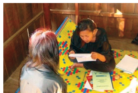
Course participant conducting an in-depth interview with a sex worker

The Sexual Health Program undertakes research and surveillance aimed at informing strategies to reduce the impact of sexually transmissible infections (STIs) and HIV, conducts trials and evaluates health programs. Work currently undertaken by the Sexual Health Program includes